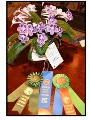
Garden Gate Garden Club's Flower Show "It's Not Easy Being Green", Horticulture Excellence and Design Excellence