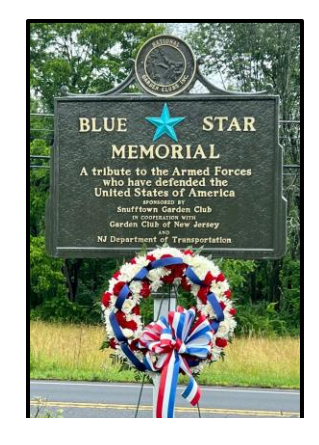
Snufftown Garden Club's newly dedicated Blue Star Memorial Marker