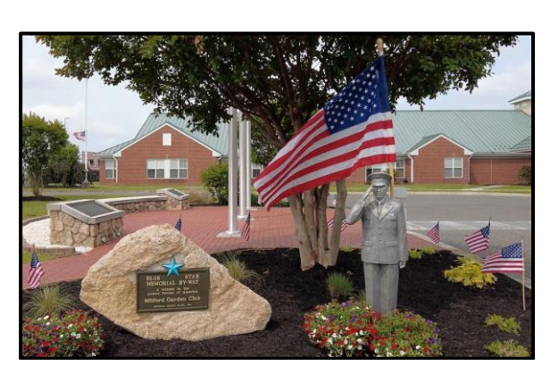
Milford Garden Club's Blue Star Memorial dedicated in May 2023

Milford Garden Club dedicated a Blue Star Memorial in May, and two more clubs have their marker dedications on the calendar. The DFGC is working with the Delaware River and Bay Authority to replace a damaged marker.